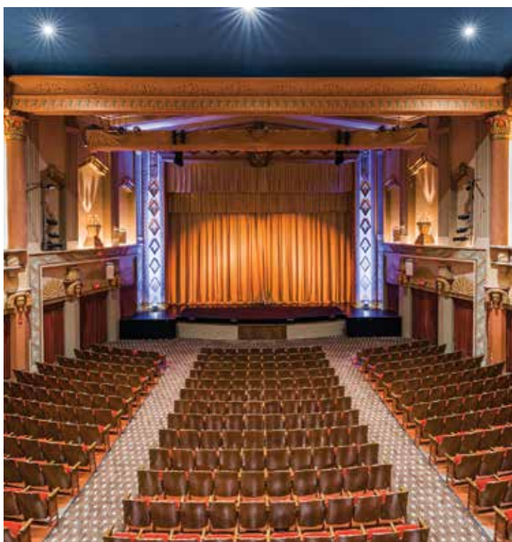
Egyptian Theatre in DeKalb